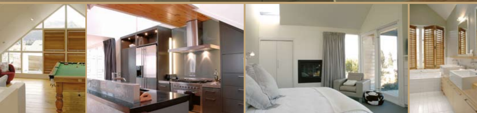
Main picture: Living area. Left to right: Mezzanine floor, kitchen, master bedroom, bathroom ensuite. Facing page: Exterior front facing, internal stairway.