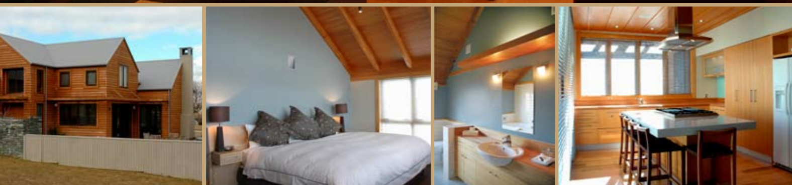
Main picture: Living areas. Left to right: Exterior back view, master bedroom, master bathroom ensuite, kitchen. Facing page: Dining area.

Upon entering this tastefully decorated, spacious and inviting home, it is immediately apparent as to why it won its category in the Master Builders' House of the Year Competition 2003. This house oozes style from the stonework in the dining and living rooms, to the tasteful pieces of artwork and furniture throughout.