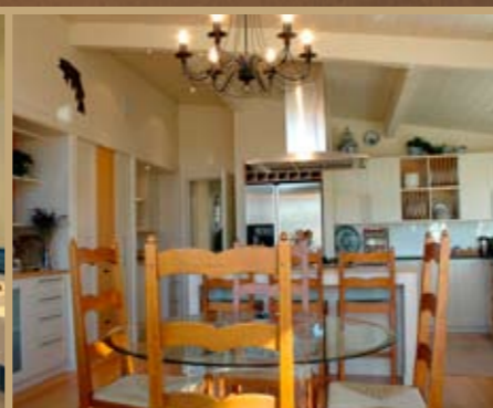
Main picture: Living area. Left to right: Exterior front, master bedroom, master bathroom ensuite, dining area. Facing page: Exterior front facing, view from patio.